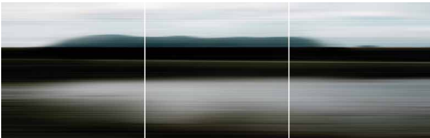
Etienne Labbe, Une colline dans la vallee , chromaogenic print on dibond, 24" x 72"