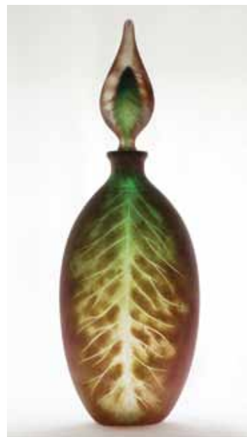
Eileen Gordon, Stopped Leaf Bottle , glass, 20" x 7" x 3"

2274 County Road #1 Bloomfield, Ontario K0K1G0 613.393.2216 www.oenogallery.com