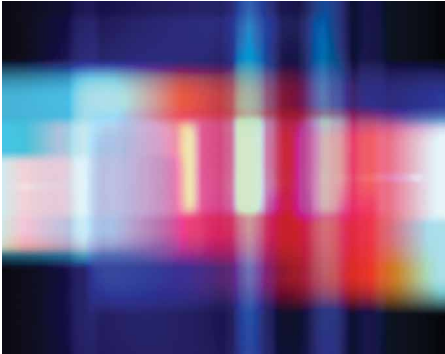
Franco DeFrancesca, Chromeleon Semaphore , pigment print and resin on board, 30" x 40"