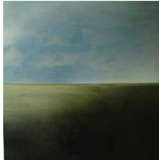
Sasha Rogers, Invisible Winds , acrylic on canvas, 60" x 60"

Today they are also growing the secondary market side of their business – offering clients the opportunity to sell quality work that they may have inherited or acquired, but now want to sell. Over