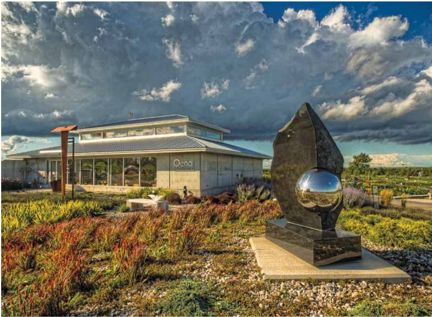
top Kim Atlin, Wilderness Camp , oil & acrylic on canvas, 30" x 40"