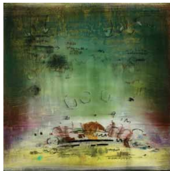
Alice Teichert, This Way Up , Acrylic and Crayon Canvas, 60" x 60"