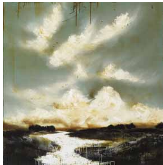
Sylvain Louis-Seize, Aeternum , mixed media on board with resin, 48" x 48"