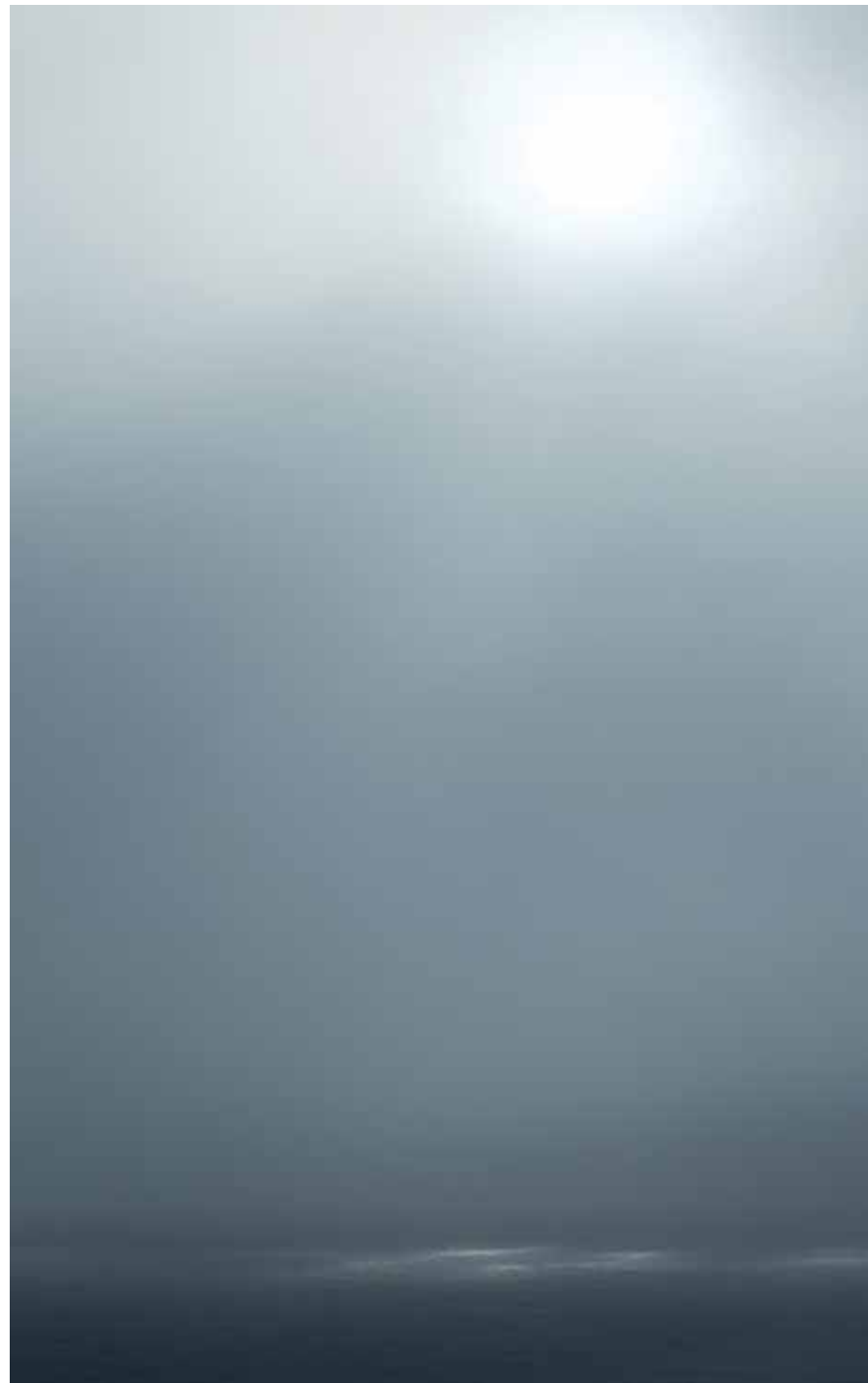
Marni Grossman, Unveilling , limited edition pigment print, 2/40 - 33" x 22"