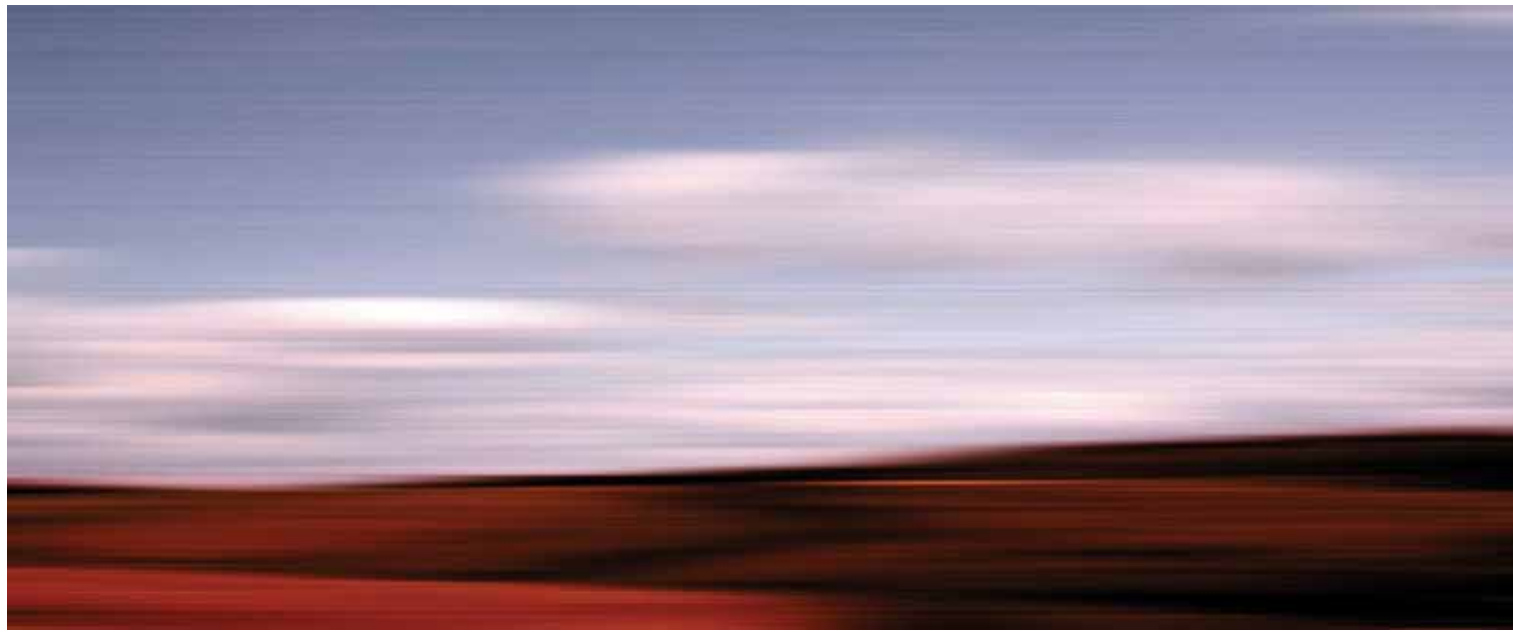
Etienne Labbé , Can we go another tomorrow? , chromogenic print on dibond, 24" x 60"