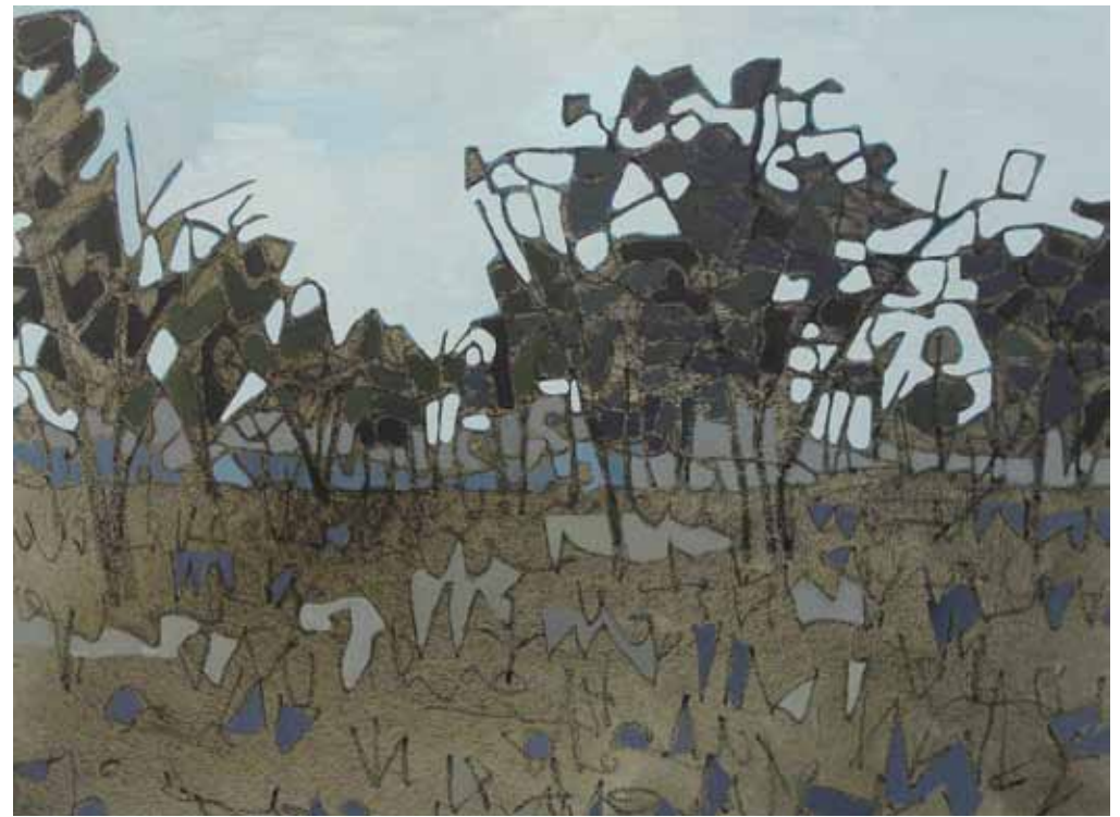
bottom Kim Atlin, Square , oil & acrylic on canvas, 48" x 68"