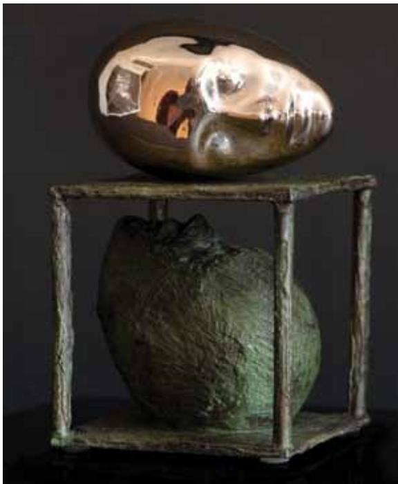
Dale Dunning, Whisper Maquet , bronze, 3/7" x 6.25" x 4" x 4"