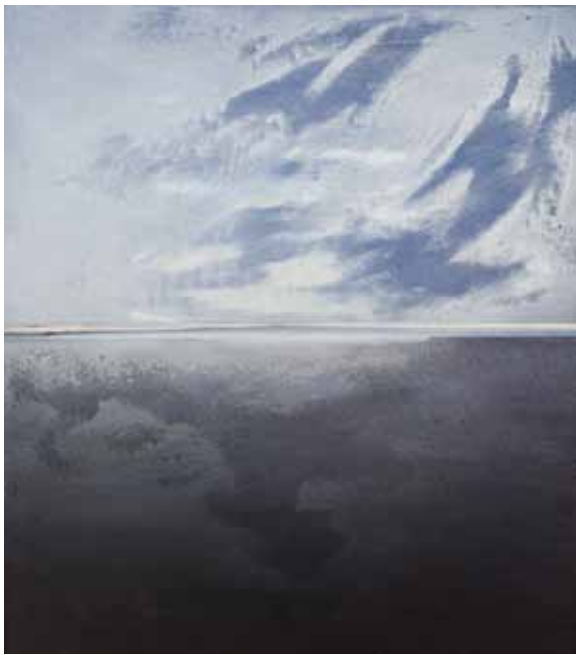
Sasha Rogers, Sea , acrylic on canvas, 42" x 36"