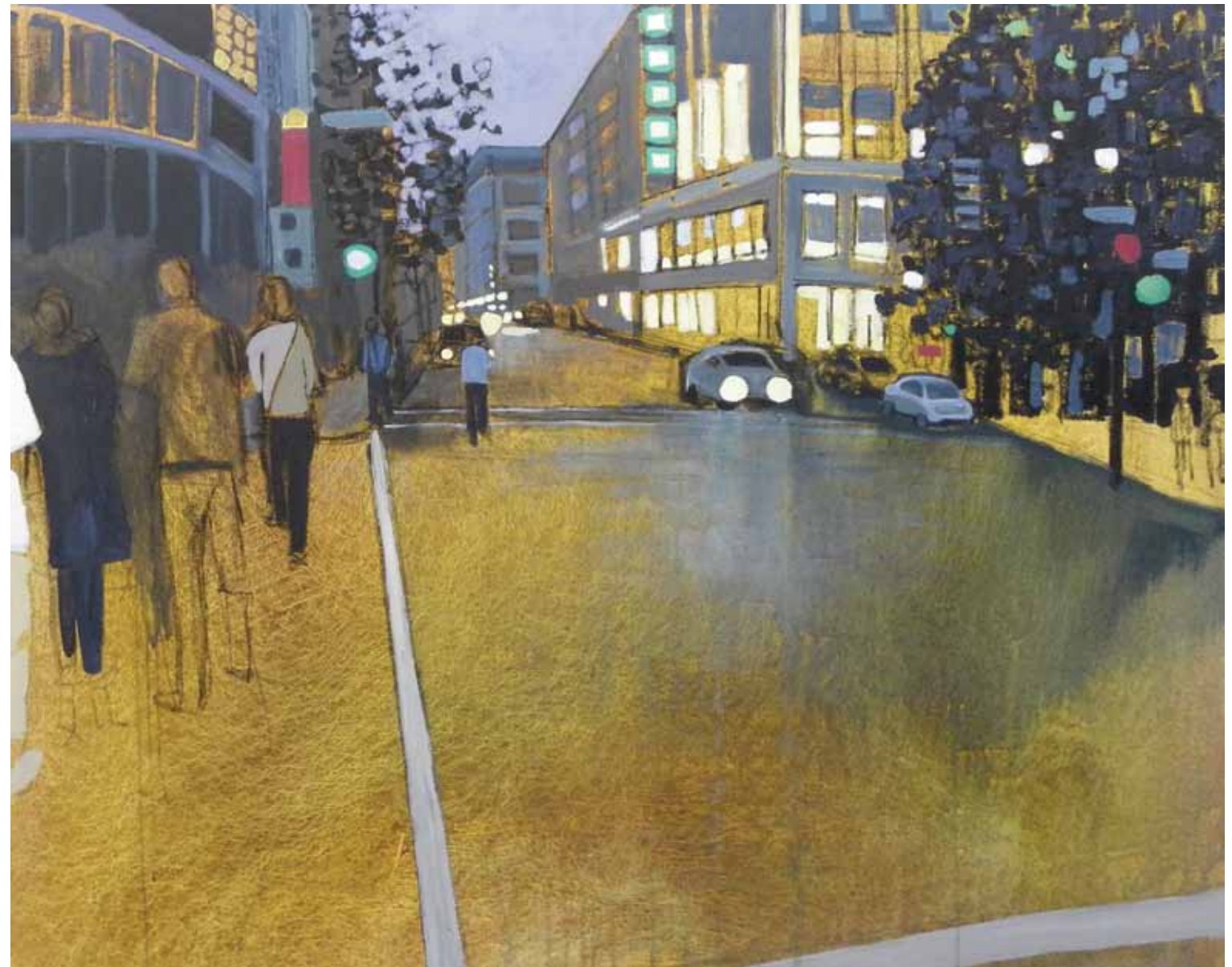
bottom, Kim Atlin, Phantoms , oil & acrylic on canvas, 30" x 40"