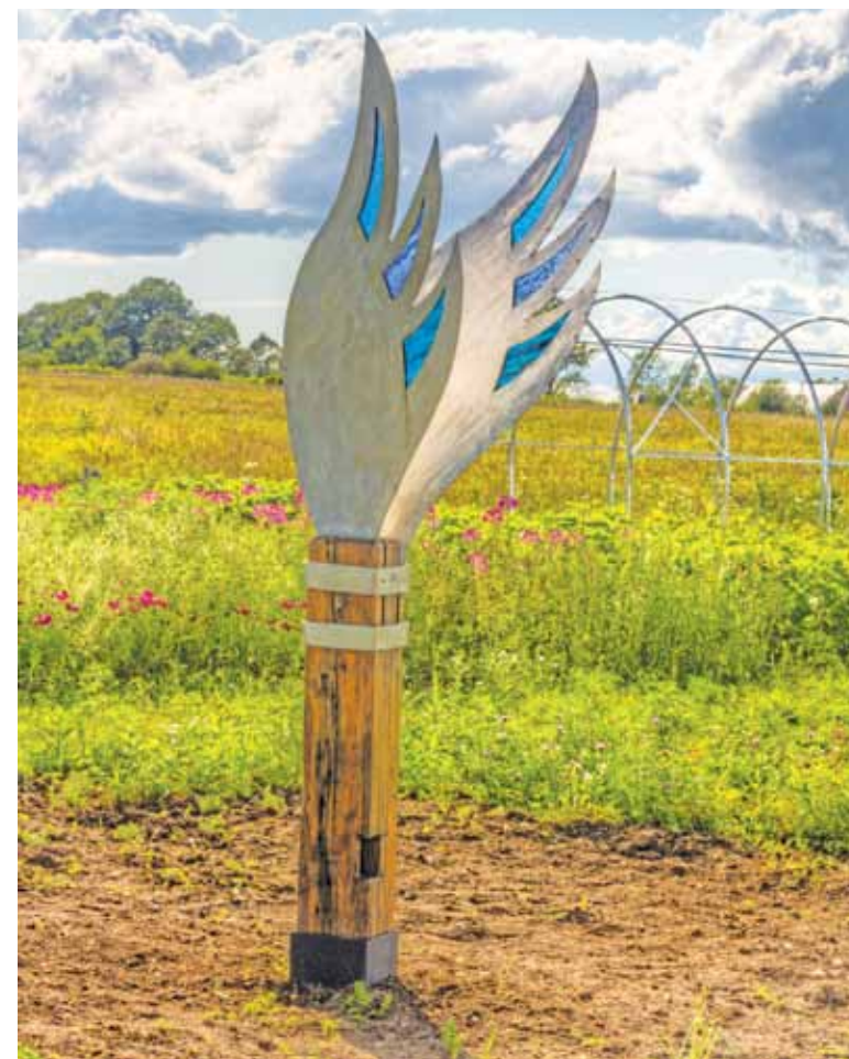
Kathryn Lipke Vigesaa, Flight