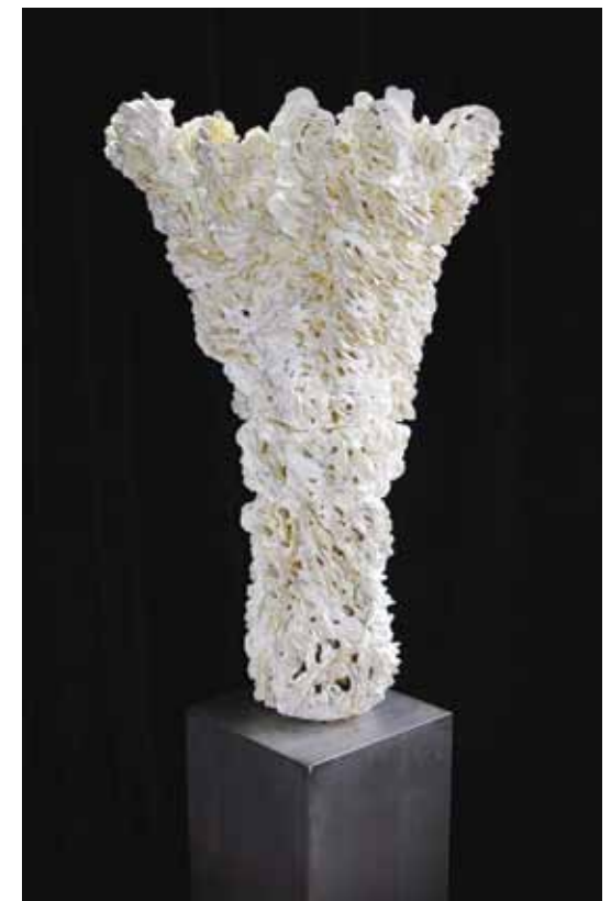
Susan Collett, RCA, Hive , hand-built ceramic, 42" x 26" x 27"

The relationship with the Winery has also been very successful and being part of a tourist destination makes it easy for visitors to include in their plans when they visit Prince Edward County. Today there are more than 40 wineries now open in Prince Edward County, and the area has one of the highest numbers of artists per capita of any Canadian region. Many visitors enjoy following the wine trail, the arts trail and the exceptional restaurants that have opened along the way – all celebrating the extraordinary landscape and