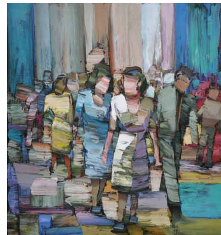
top left, Scott Pattinson, Silence #22 , acrylic on canvas, 72" x 60"