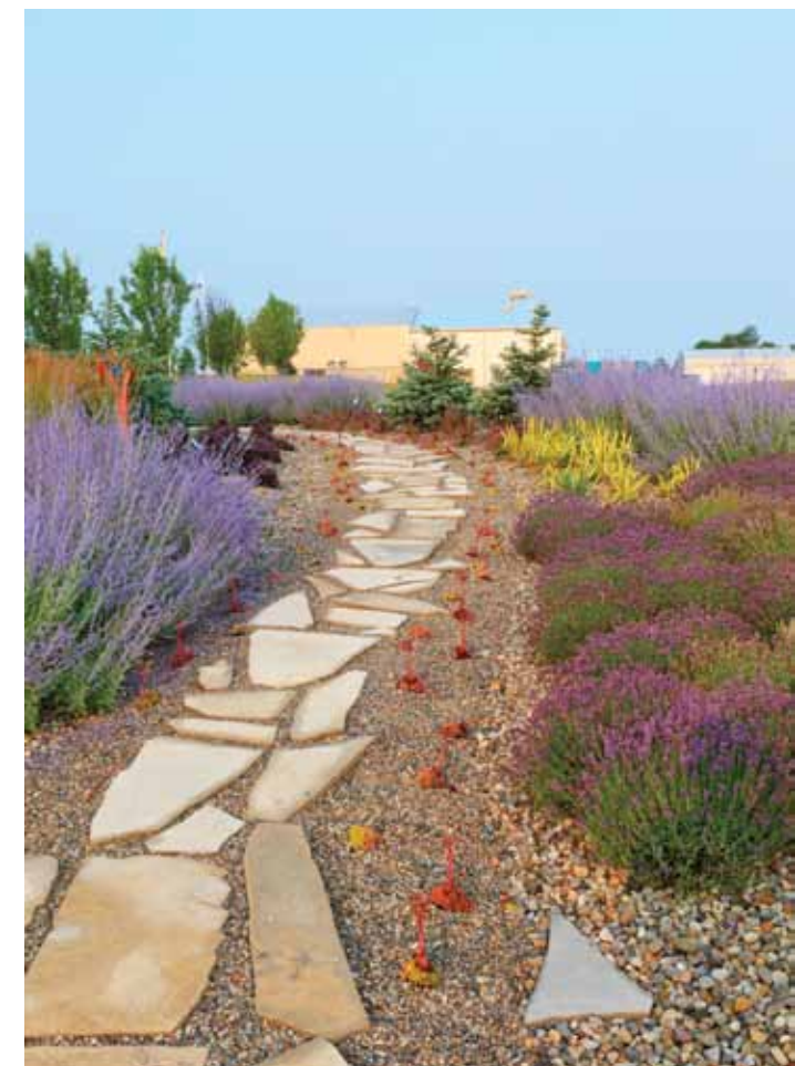
Path in Sculpture Garden